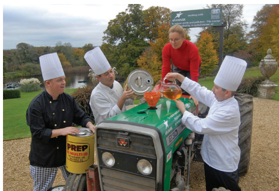
Biofuel tractor at Kingston Mauward College, Dorset.