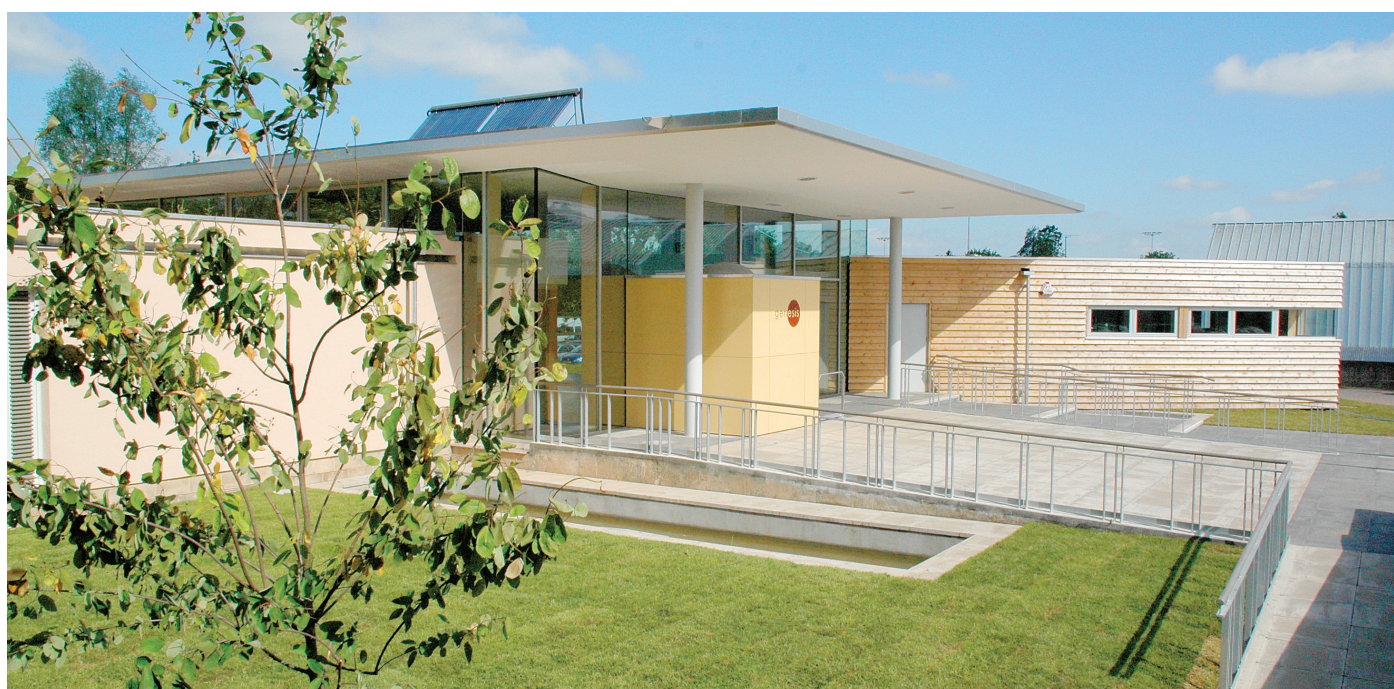
Award winning sustainable building, the Genesis Centre, Somerset College

genesisproject.com – The sustainable conference centre at Somerset College