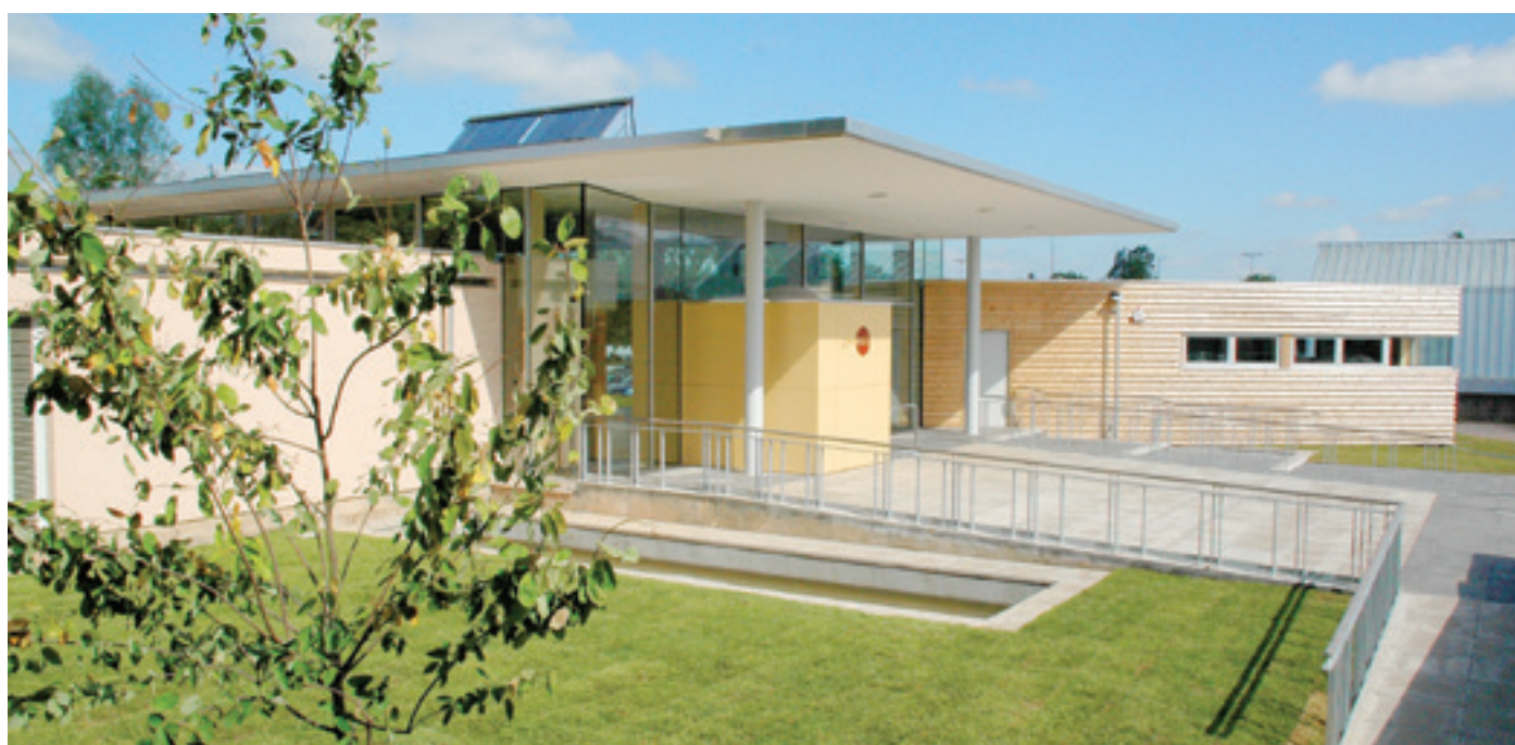
Award winning sustainable building, the Genesis Centre, Somerset College

genesisproject.com – The sustainable conference centre at Somerset College