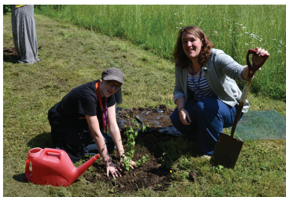
Tree planting to offset carbon footprint at Wiltshire College.