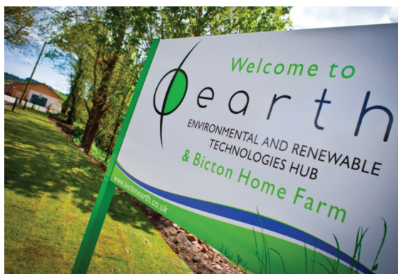
Bicton EaRTH: designed to showcase the most up to date renewable technologies at Bicton College, Devon.

65% encouraged student participation in community benefit projects