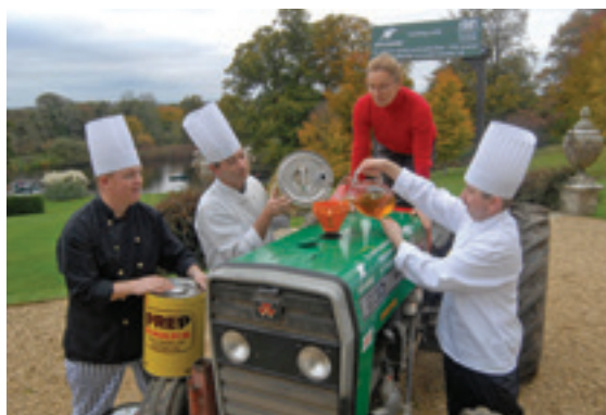
Biofuel tractor at Kingston Mauward College, Dorset.