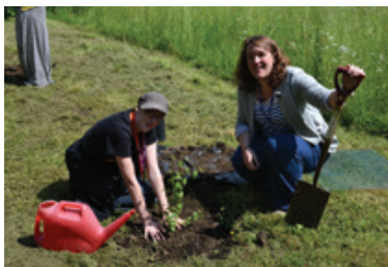
Tree planting to offset carbon footprint at Wiltshire College.