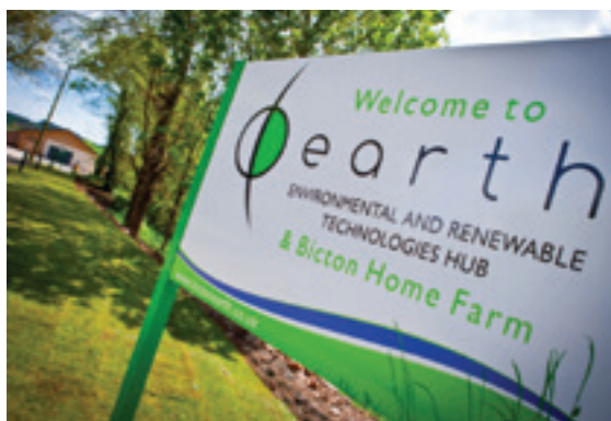
Bickton EaRTH: designed to showcase the most up to date renewable technologies at Bickton College, Devon.

65% encouraged student participation in community benefit projects